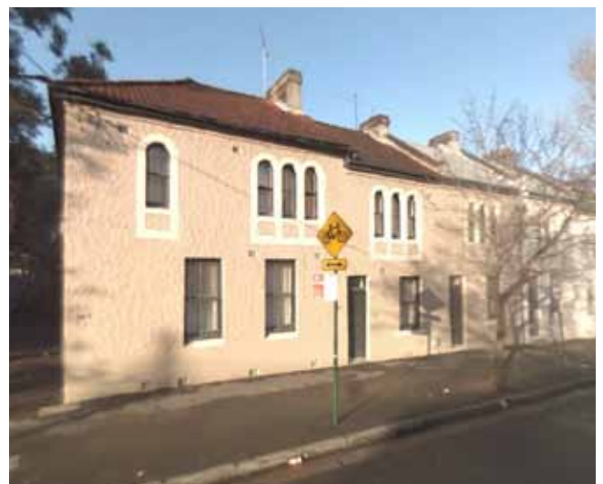
Sydney City Apartments